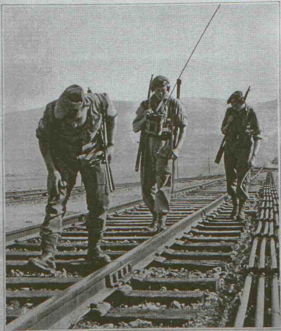
THE CEASELESS WATCH AND WARD AGAINST TERRORIST ACTIVITIES IN PALESTINE: TROOPS PATROLLING THE RAILWAY TRACKS NEAR JERUSALEM.

British troops in Palestine keep constant watch and ward against terrorist activities and execution of their duties. Men of the 1st Battalion, The Duke of Cornwall's Light Infantry are here seen patrolling the railway tracks between Jerusalem and the village of Azra, on the line to Lydda. They act in close contact with