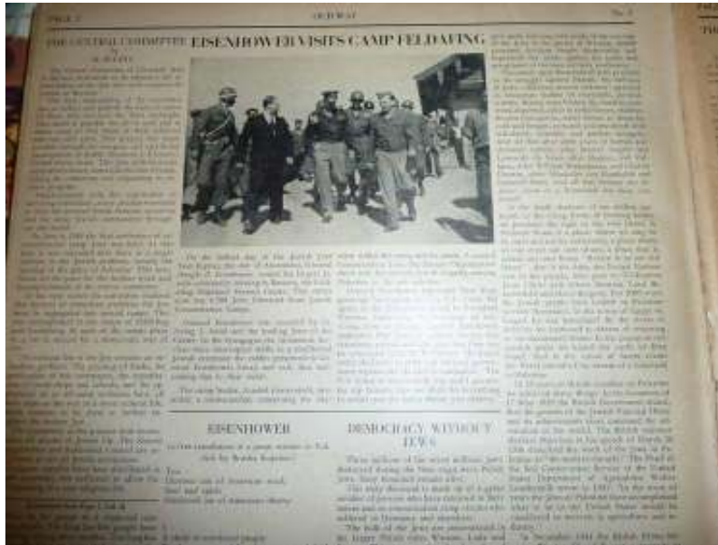
Item No 1