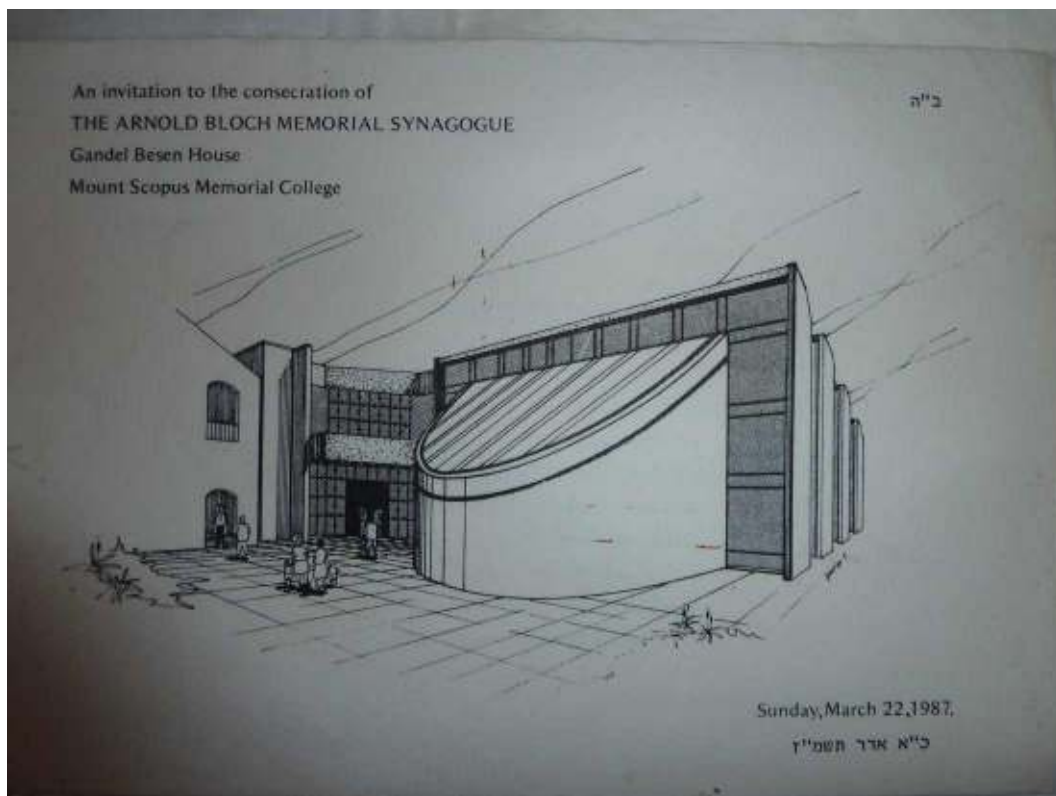
Item No 4

Judaica Including Some Interesting Parliamentary Papers and Ephemera