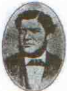
THE LADY THE SHOOF'S WIFE (Shoof)