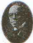
THE MINYAN MAN'S (Minyan Man)

NOW sometimes it makes one think that one would rather be the Shoof or even a Minyan Man;